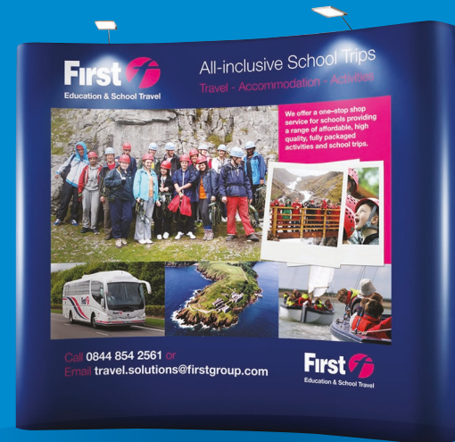
First Travel Education Exhibition System