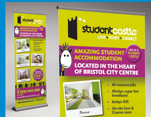
Student Castle Exhibition System