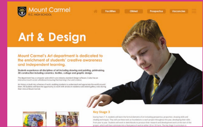
Mount Carmel R.C. High School